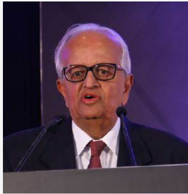
Dr. Bimal Jalan Former RBI Governor