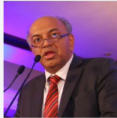
Sanjeev Bikhchandani Founder, Info Edge India