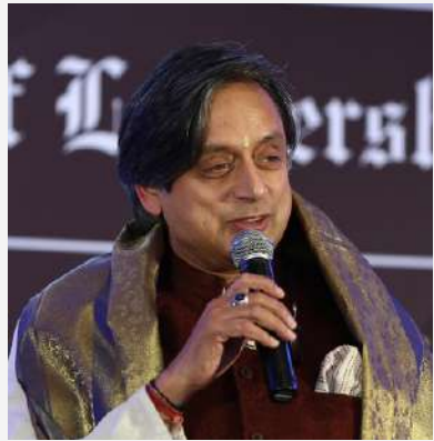
Dr. Shashi Tharoor Member of Parliament and Author