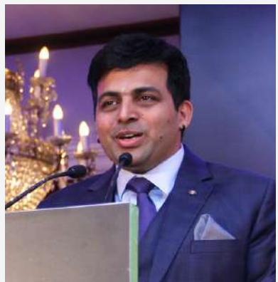
Amit Tandon Stand-up Comedian